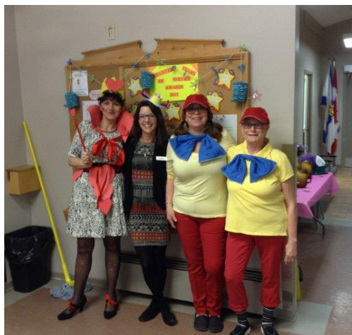
Volunteer Appreciation Mad Hatter Tea party