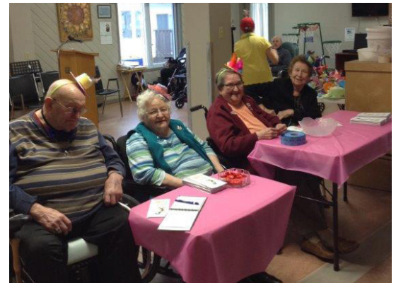
Our resident greeters at our Volunteer Appreciation Mad Hatter Tea Party