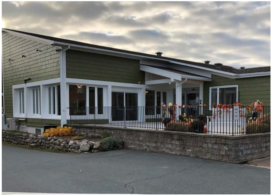
The new updated exterior of Shoreham Village.

This project was awarded to Greytop and is scheduled to be completed at the end of October. This includes replacement of sump pumps in the boiler room and exterior piping. Replacement of the exterior piping has been completed and equipment is scheduled to arrive this week to replace the pumps.